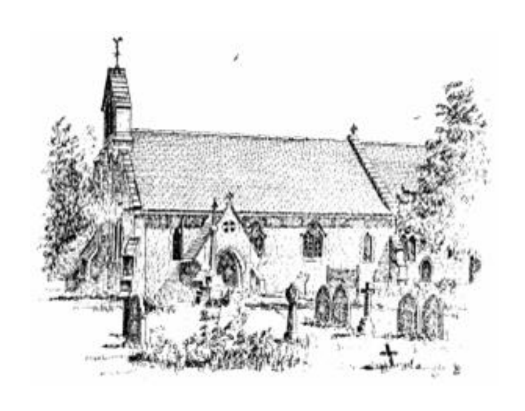
The Second Sunday before Lent Sunday 23<sup>rd</sup> February 2025