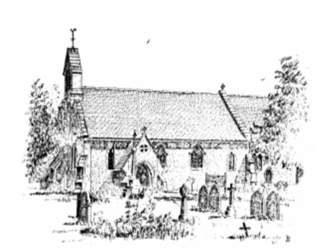
The Third Sunday before Lent Sunday 16<sup>th</sup> February 2025